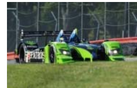
American Lemans Series. 7-9 August, 2009. Acura Sports Car Challenge. Mid Ohio Sports car Course.