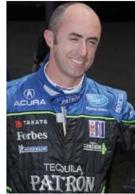
American Lemans Series. 7-9 August, 2009. Acura Sports Car Challenge. Mid Ohio Sportscar Course. Lex