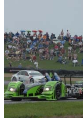
American Lemans Series. 7-9 August, 2009. Acura Sports Car Challenge. Mid Ohio Sports car Course.