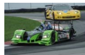
American Lemans Series. 7-9 August, 2009. Acura Sports Car Challenge. Mid Ohio Sports car Course.